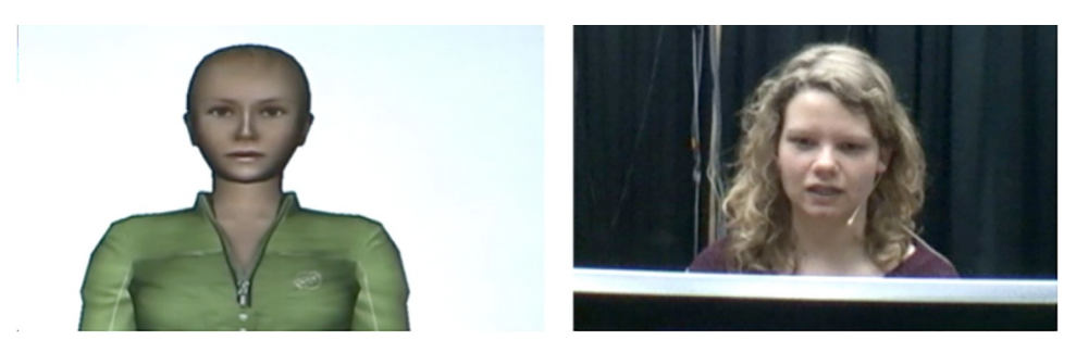
Fig 1. Virtual listener (left) interacting with human speaker (right) in the present experimental set-up (see also S2 Video).

Avatar characteristics and behaviors. The experiment was programmed using World-Viz's Vizard 5.5. Three different female avatars were created based on a stock avatar produced by WorldViz. The avatars' speech was pre-recorded by three different female native speakers of Dutch and played at relevant points during the experiment. The avatars' lip movements were programmed to match the amplitude of the pre-recorded speech files, creating the illusion of synchronization. The speech materials consisted of a general introduction (e.g., Hoi, Ik ben Julia, leuk je te ontmoeten!; 'Hi, I'm Julia, nice to meet you!' and Ik heb een aantal vraagen aan jou; 'I have a couple of questions for you') and a set of 18 open-ended questions (e.g., Hoe was je weekend, wat heb je allemaal gedaan?; 'How was your weekend, what did you do?'). The avatar also gave a response to the participant's answer (e.g., Oh ja, wat interessant!; 'Oh, how interesting!') before proceeding to the next open question (e.g., Ik heb nog een vraag aan jou; 'I have another question for you'), or to close the interaction (Hartelijk bedankt voor dit gesprek, ik vond het gezellig!; 'Thank you very much for this conversation, I enjoyed it!') (see S2 Video for an example of a trial). Whenever an avatar was in the listener role, her feedback responses—the crucial experimental manipulation in the present study—were modeled on typical feedback behavior that occurs in natural conversation. These behaviors consisted of